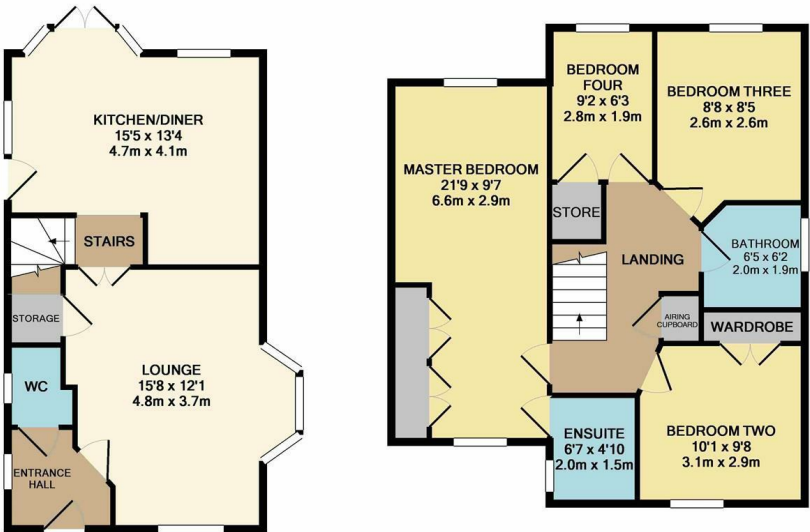
GROUND FLOOR APPROX. FLOOR AREA 466 SQ.FT. (43.3 SQ.M.)